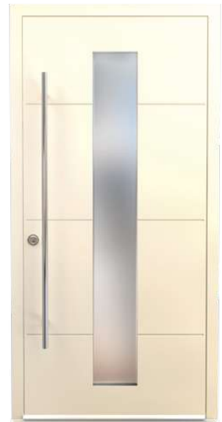
Colour: CWD002 Amersham DM0001