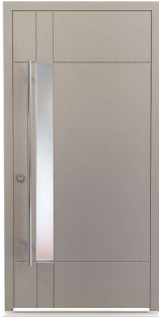
Colour: SEN026 Clifton DM0006