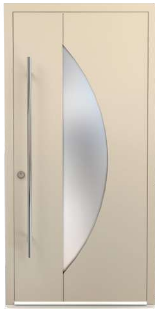
Colour: CWD004 Richmond DM0022