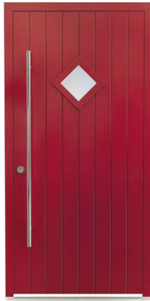
Colour: CTN005 Coleford DT0008

Whether it's a replacement for an existing door or a new build project, you can tailor the door to meet your exact aesthetic, security and performance requirements.