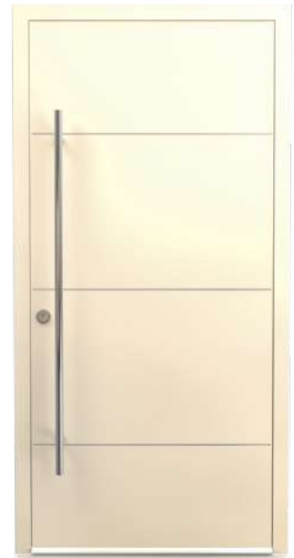
Colour: CWD002 Sherbourne DM0021