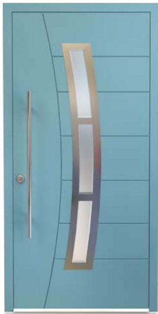
Colour: SEN028 Marlborough DM0014