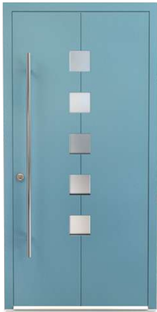
Colour: SEN028 Falmouth DM0008