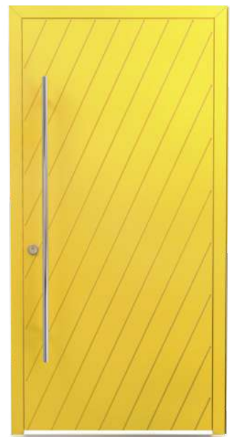
Colour: CTN006 Axbridge DT0009