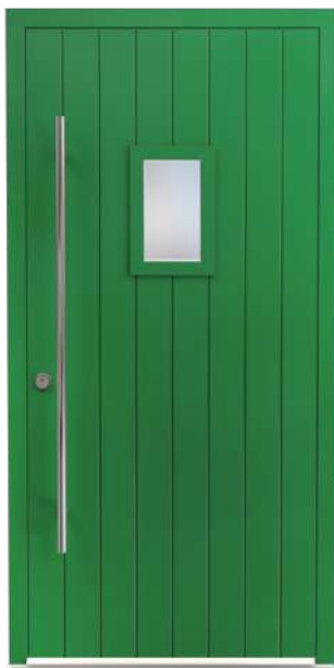
Colour: CTN003 Purton DT0011