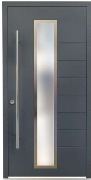
Colour: SEN015 Kensington DM0012