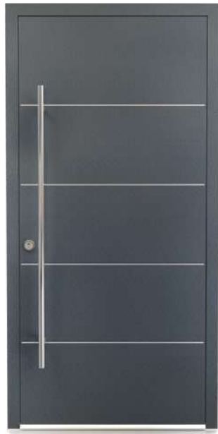
Colour: SEN015 Oxford DM0031