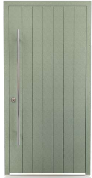
Colour: SEN018 Hambleton DM0009