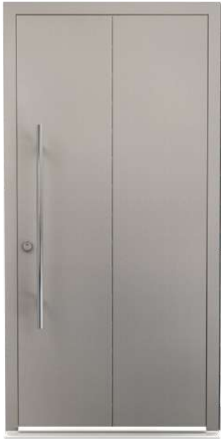
Colour: SEN025 Canonbury DM0005