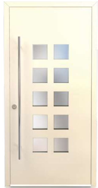
Colour: CWD002 Purbeck DM0018