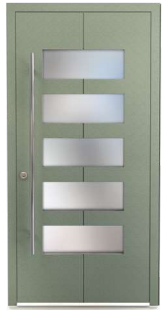
Colour: SEN018 Pembroke DM0016