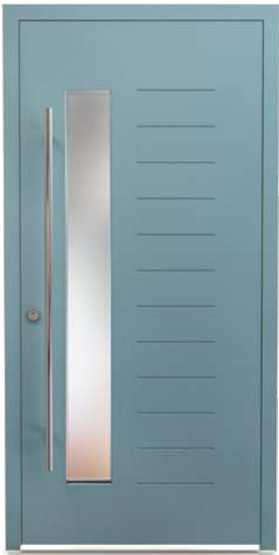
Colour: SEN028 Oakham DM0015