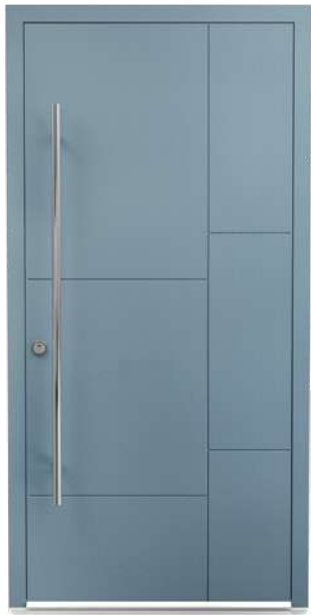
Colour: SEN028 Teddington DM0024