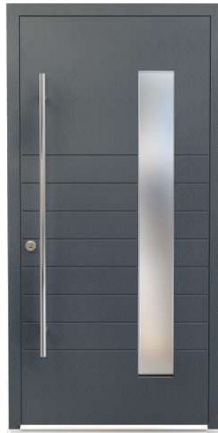
Colour: SEN015 Ashwell DM0002