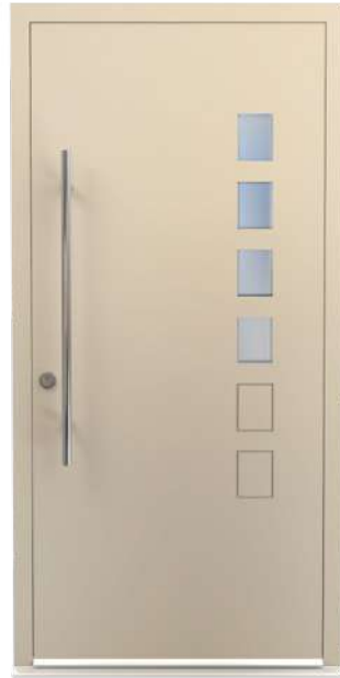
Colour: CWD004 Mayfair DM0017