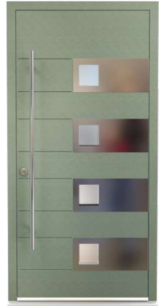
Colour: SEN018 Highgate DM0010