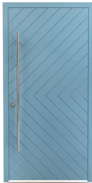
Colour: CTN002 Somerton DT0012