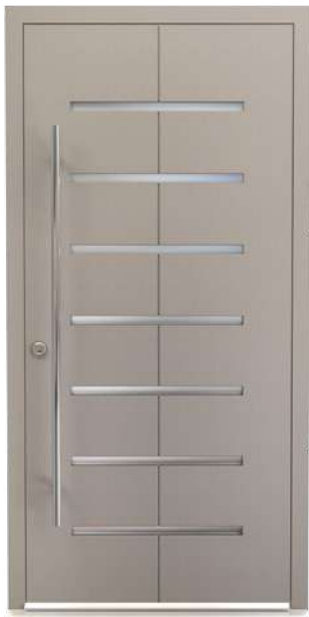
Colour: SEN026 Rushcliffe DM0019