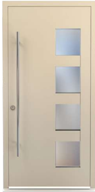
Colour: CWD004 Shipston DM0023