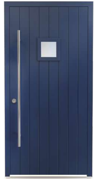
Colour: CTN001 Churchill DT0010