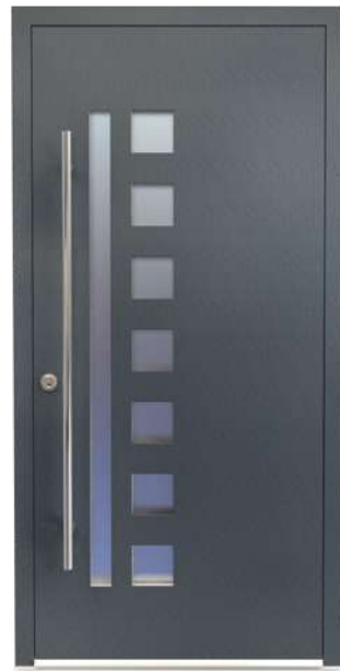
Colour: SEN015 Kingsbridge DM0011