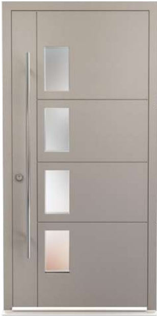
Colour: SEN026 Broadstone DM0004