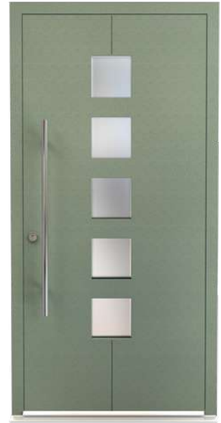
Colour: SEN018 Lymington DM0013