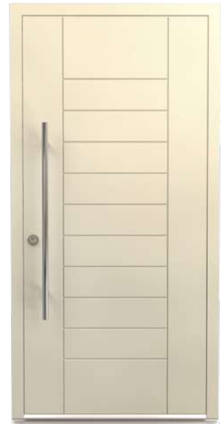
Colour: CWD002 Bloomsbury DM0003