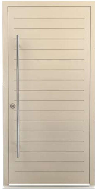
Colour: CWD004 Eastleigh DM0007